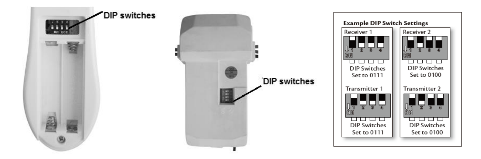
Fig. 1 Remote battery compartment

Note: To access the receiver DIP switches, remove the DIP Switch cover.